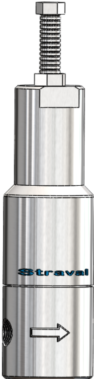
RVC05-Npt angle pattern